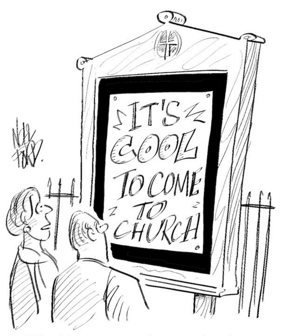
"It's either an appeal to youth culture or we can't afford to service the boiler for the Winter season"