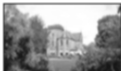
Ryton Towers Residential Care Home Whitewell Lane, Ryton, NE40 3PG Tel. 0191 4138518 Email. rytontowers@wellburncare.co.uk

Firstly, we have Ryton Towers, which is a truly impressive Home surrounded by two acres of idyllic private gardens.